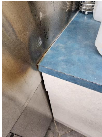
Heat damage due to the burner